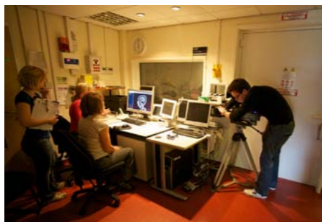
Filming in the console room of the 1.5 T scanner