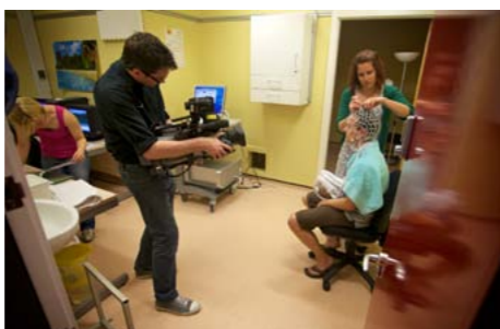
Graduate students in the net. EEG experiment captured on HD video