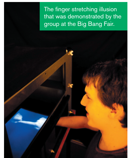
The finger stretching illusion that was demonstrated by the group at the Big Bang Fair.